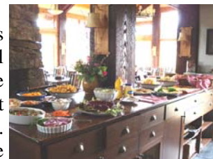
Apple Fest lunch buffet