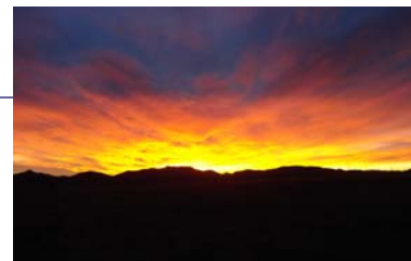
Sunrise at the Ranch