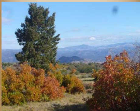
Great fall day