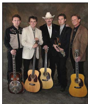
Sons and Brothers Band