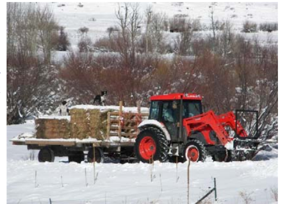
The new ranch tractor in action

an excellent class that teaches so much more than time management. I got so much more out of attending this class than I had hoped for. So back to the spring list.