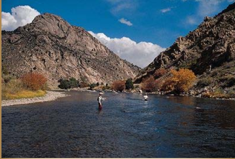
Fly fishing on the Arkansas