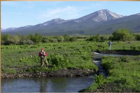
Fly Fishing at the ranch