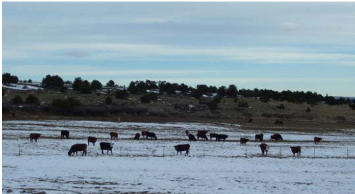
The cow herd looking for some green grass

Wow, what a winter! From everything that I have heard in the valley this has been one for the record books. After a winter like this, you are definitely ready for spring. With all the snow fall the snowpack is looking great, and will give us plenty of water to irrigate with for the year. The moisture level in the ground is awesome, so as soon as it warms up some the green grass should really pop. We are already see-